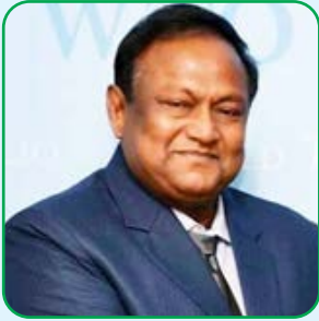
Mr. Tipu Munshi, MP Hon'ble Minister Ministry of Commerce